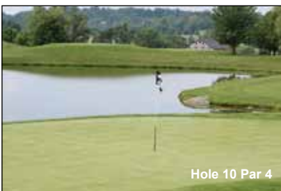
Hole 10 Par 4

More diverse threats await you on the back nine at Worthington Manor. The first two medium length par 4s give an opening to put some decent numbers on your scorecard. Golfers frequently discuss the par 4 twelfth, as tough a hole as you'll find anywhere. Your approach over a ravine to an elevated green with deep bunkers and a sharp drop-off to the left creates a real nail-biter (see story on page 44). Thirteen travels slightly uphill and normally requires three shots to get home on this par 5. The attractive downhill par 4 fourteenth hole plays back to the clubhouse allowing you to replenish your