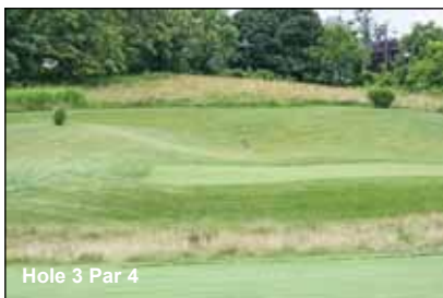
Hole 3 Par 4

I've been around the game of golf long enough that most people will tell you that I'm very qualified to acknowledge each and every positive feature of a golf course. As part of my job, I recommend golf courses to out-of-town travelers who may have never stepped foot on some of the courses they plan to attempt. When customers ask me to choose courses for them in the Frederick, Maryland, area, I endorse the Worthington Manor Golf Club in Urbana as one of the first. The now infamous Frederick golf boom began when this Ault-Clark signature course opened their doors in 1998. Designed in the game's grand tradition, the layout offers a picturesque country setting that hasn't changed much over the years.