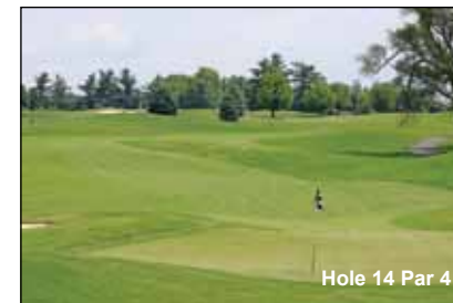
Hole 14 Par 4

Worthington Manor has several distinctive characteristics that have always stood out to me. At the Manor you can enjoy that great feeling you get anytime you play a course that is almost totally void of housing. A few lovely homes skirt the border of the property. Otherwise, no structures run interference. Worthington Manor can