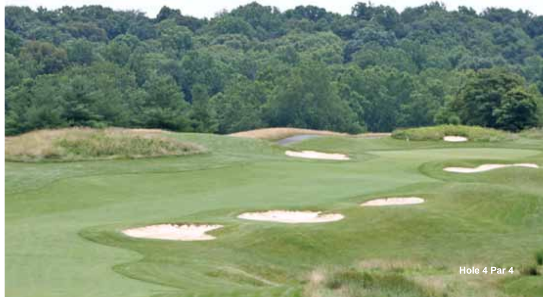
Hole 4 Par 4